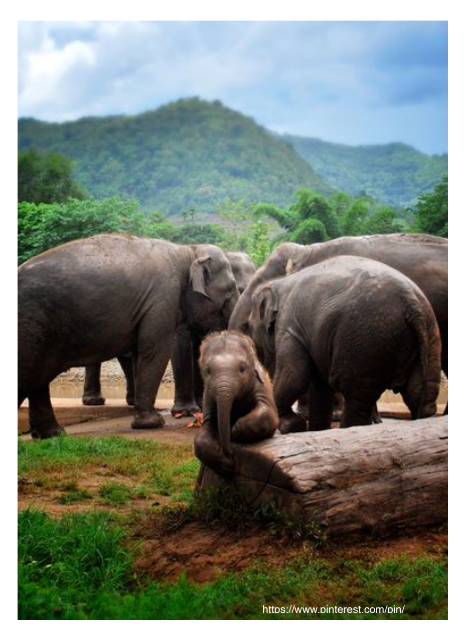
"Thailand is listed as the 4th best buy place to buy real estate in the world and Chiang Mai is the number one city in Thailand for potential real estate growth"