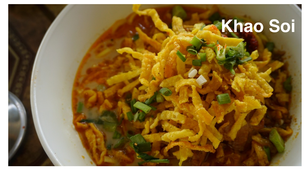
"Khao Soi is a creamy coconut curry noodle based dish originating in Northern Thailand (with many linking its origins specifically to the city of Chiang Mai"