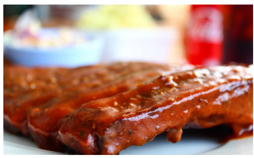
Rose's Roadhouse & New York Style Pizza