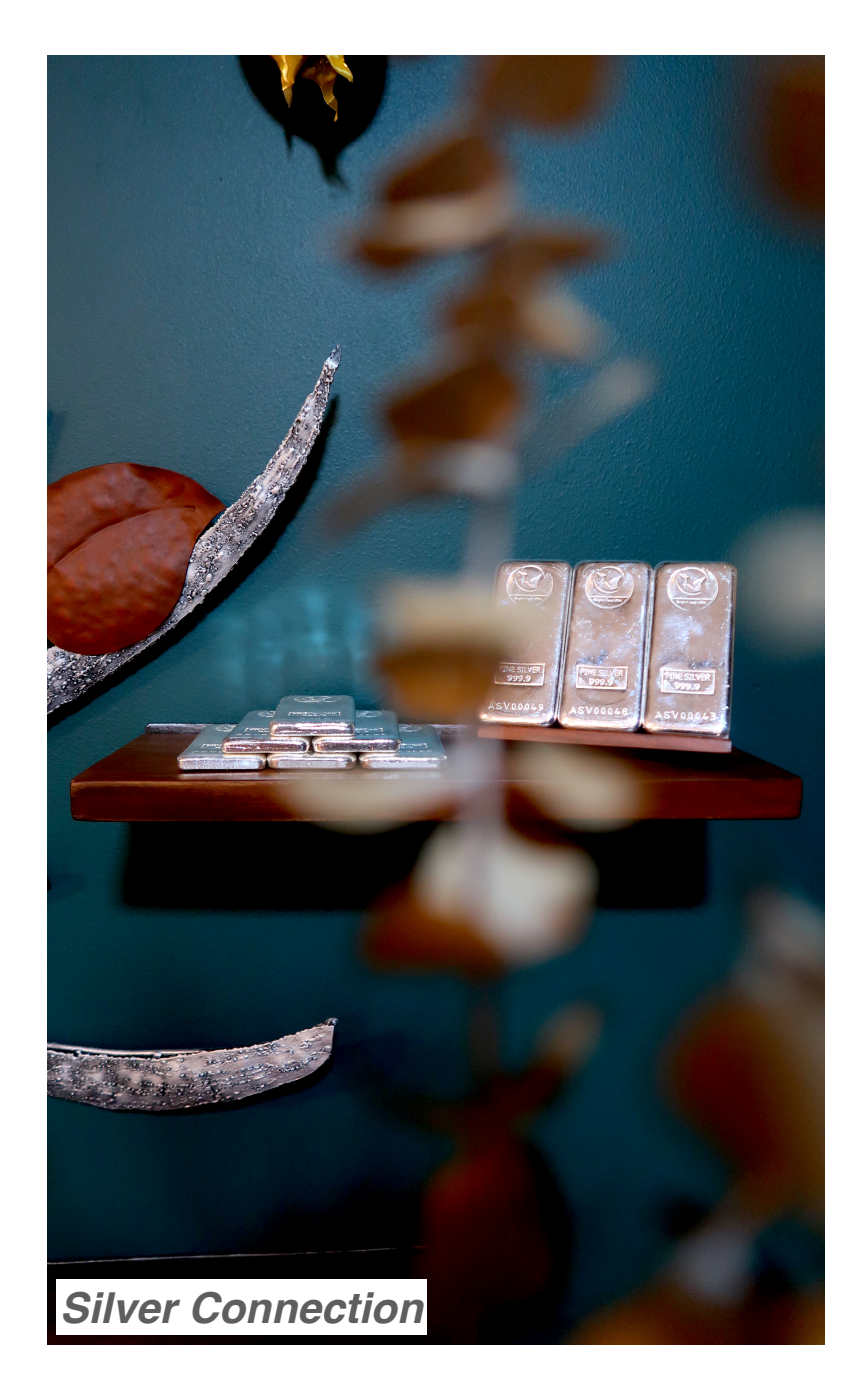
8 Profitable Income Producing Businesses ++